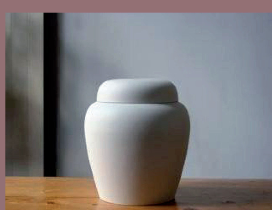
"classic" (urn no 1), unglazed prototype, 2004