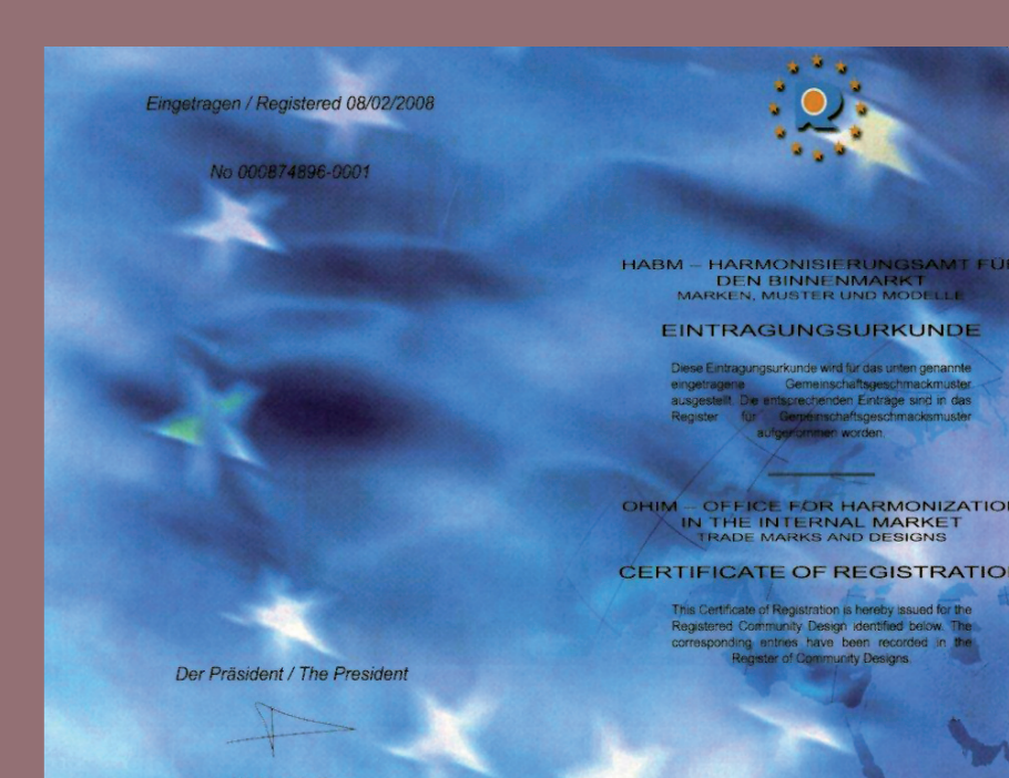
Certificate of Registration, 2008